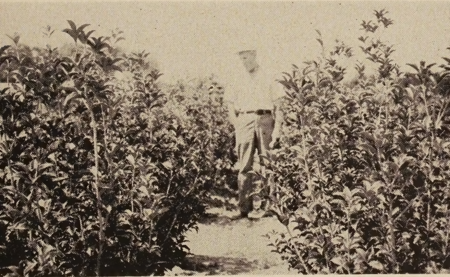
Osmanthus fortunei. Sept. 1954

OSMANTHUS fortunei. Very handsome. Spiny leaf resembling Holly.